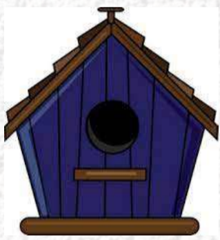
Build a Birdhouse